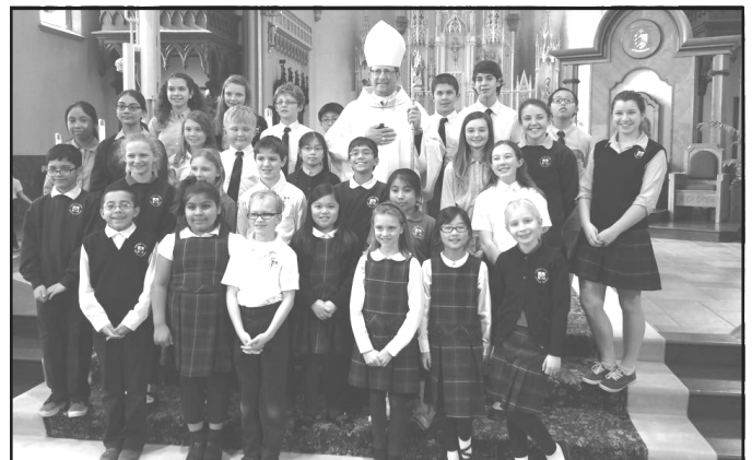
The Corpus Christi Choir sang at Mass at the Cathedral of St. Andrew during Catholic Schools Week recently.